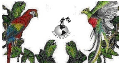
EARTHQUEST Biological Field