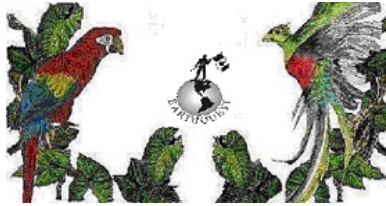
EARTHQUEST Environmental Consultants